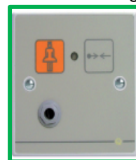
Standard nurse call socket

Ensure you have correctly identified the interface and test before using on a resident.